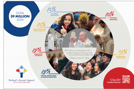
Posters - English and Spanish