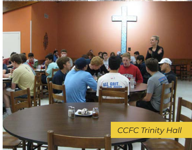
CCFC Trinity Hall