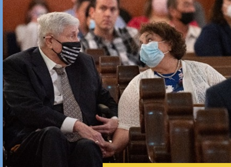
Golden Anniversary Mass