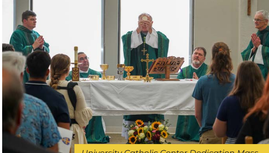
University Catholic Center Dedication Mass

Having been a Catholic at The University of Texas at Dallas for the last two years, what the Catholic community has really lacked is a place to call home. The new addition of the University Catholic Center is very exciting for me and so many students at UT Dallas. The ability to receive the Sacraments daily, have a space to pray with Jesus present, and a place to spend time with friends is a game changer. I'm excited to see the ways that Jesus will use the University Catholic Center to change lives on this campus in the coming years.