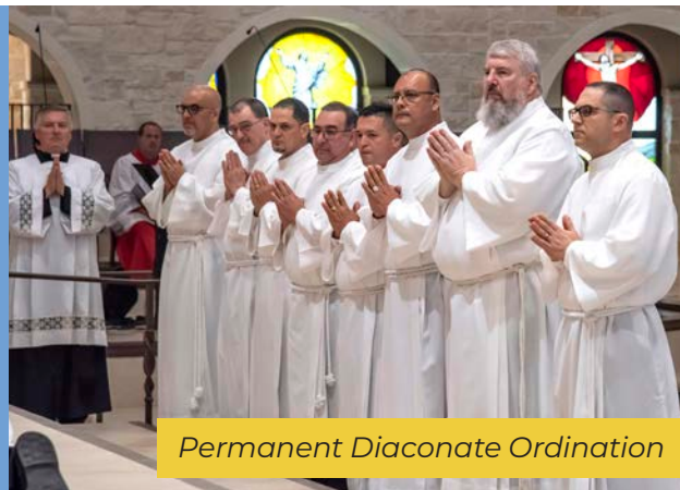
Permanent Diaconate Ordination

Pope Francis (Address to Seminarians and Novices, July 6, 2013)